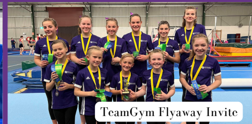
TeamGym Flyaway Invite